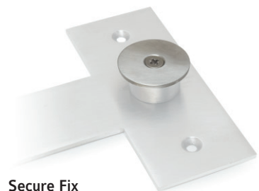
Secure Fix Prevents tampering or quick removal.

For information on the correct positioning and installation of your SEPURA™ Separator Unit please see the accompanying leaflet.