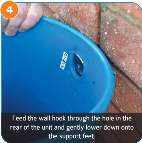
Feed the wall hook through the hole in the rear of the unit and gently lower down onto the support feet.