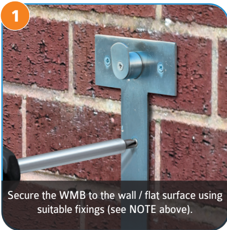
Secure the WMB to the wall / flat surface using suitable fixings (see NOTE above).

NOTE: SEPURA™ do not supply fixings for the WMB with each kit. It is your responsibility to use appropriate fixings for the surface that you wish to attach it to. SEPURA™ will not be responsible for any accidental or performance issues arising from fixing of the WMB unit.