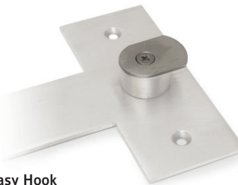
Easy Hook Allows the unit to be lifted on and off quickly