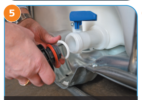
Attach the long outlet pipe to the outlet of the unit by screwing the black ring onto the thread. Ensure that the pipe is fitted with a white sealing ring.