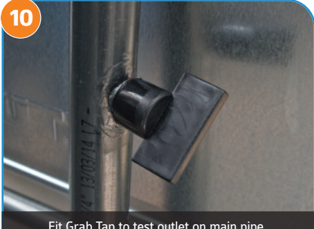
Fit Grab Tap to test outlet on main pipe. Take a sample of condensate once a week and test. (see over for details)