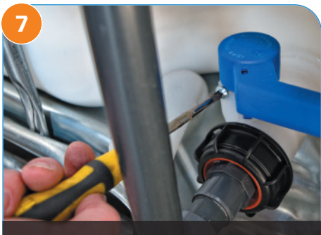
Unlock the valve lever by loosening the screw below the blue lever arm.