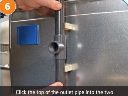
holders to secure the pipe in the upright position on the front panel.