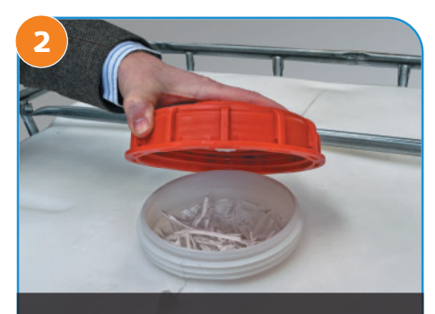
Remove red cap from the top of the unit. (Retain this cap for use during collection)