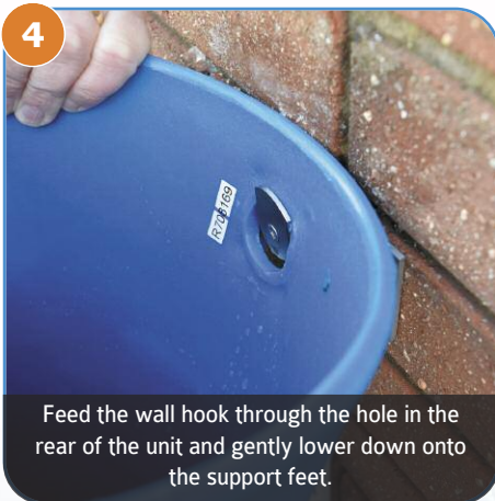
Feed the wall hook through the hole in the rear of the unit and gently lower down onto the support feet.