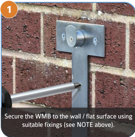
Secure the WMB to the wall / flat surface using suitable fixings (see NOTE above).

NOTE: SEPURA™ do not supply fixings for the WMB with each kit. It is your responsibility to use appropriate fixings for the surface that you wish to attach it to. SEPURA™ will not be responsible for any accidental or performance issues arising from fixing of the WMB unit.