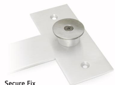
Secure Fix Prevents tampering or quick removal.

For information on the correct positioning and installation of your SEPURA™ Separator Unit please see the accompanying leaflet.