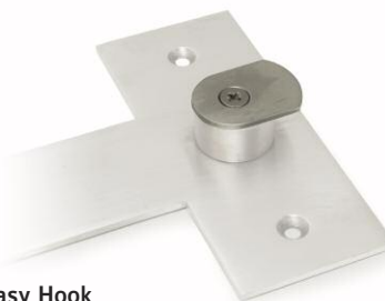
Easy Hook Allows the unit to be lifted on and off quickly